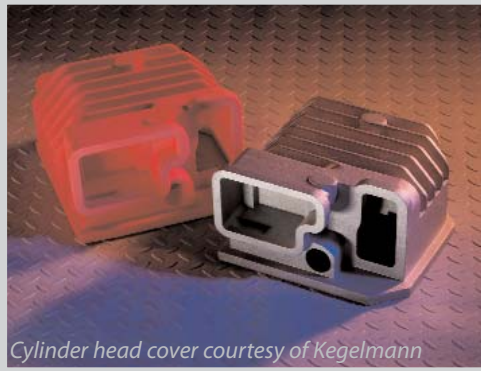
Cylinder head cover courtesy of Kegelmann

Directly produce complex investment casting patterns without tooling.